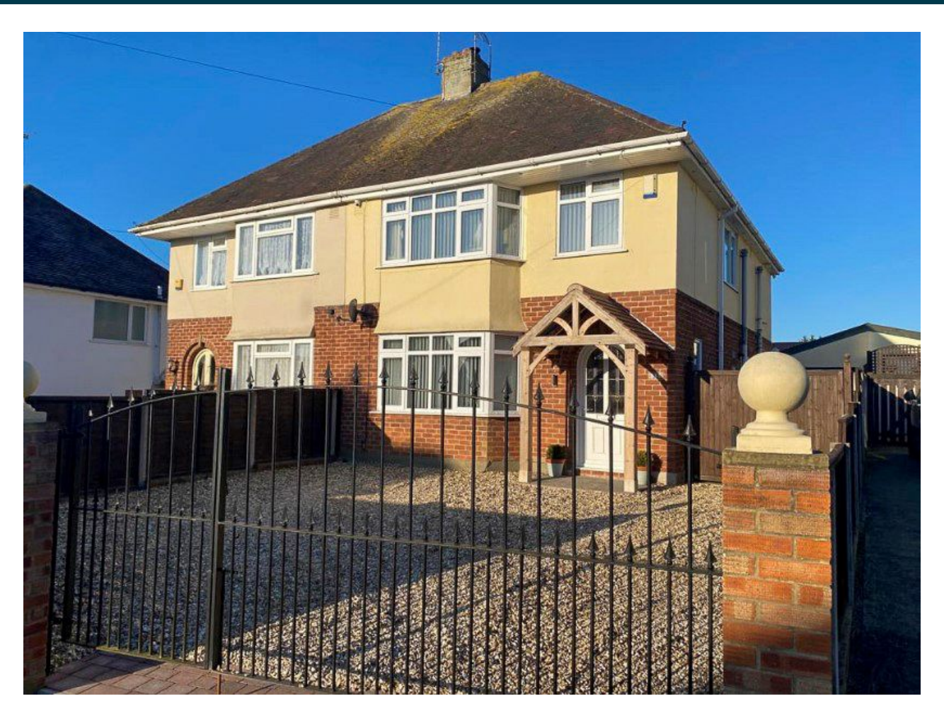
35, Coronation Avenue, Yeovil, Somerset BA21 3DY OIEO £290,000

Towers Wills welcome to the market this extended beautiful family home which needs to be viewed to be fully appreciated. Comprising: Hallway, Cloak W.C, Living room, dining room, family room, re-fitted kitchen, three bedrooms, luxurious bathroom, gated driveway, large garage, enclosed private garden. Walking distance to local schools, shops and Johnson Park.