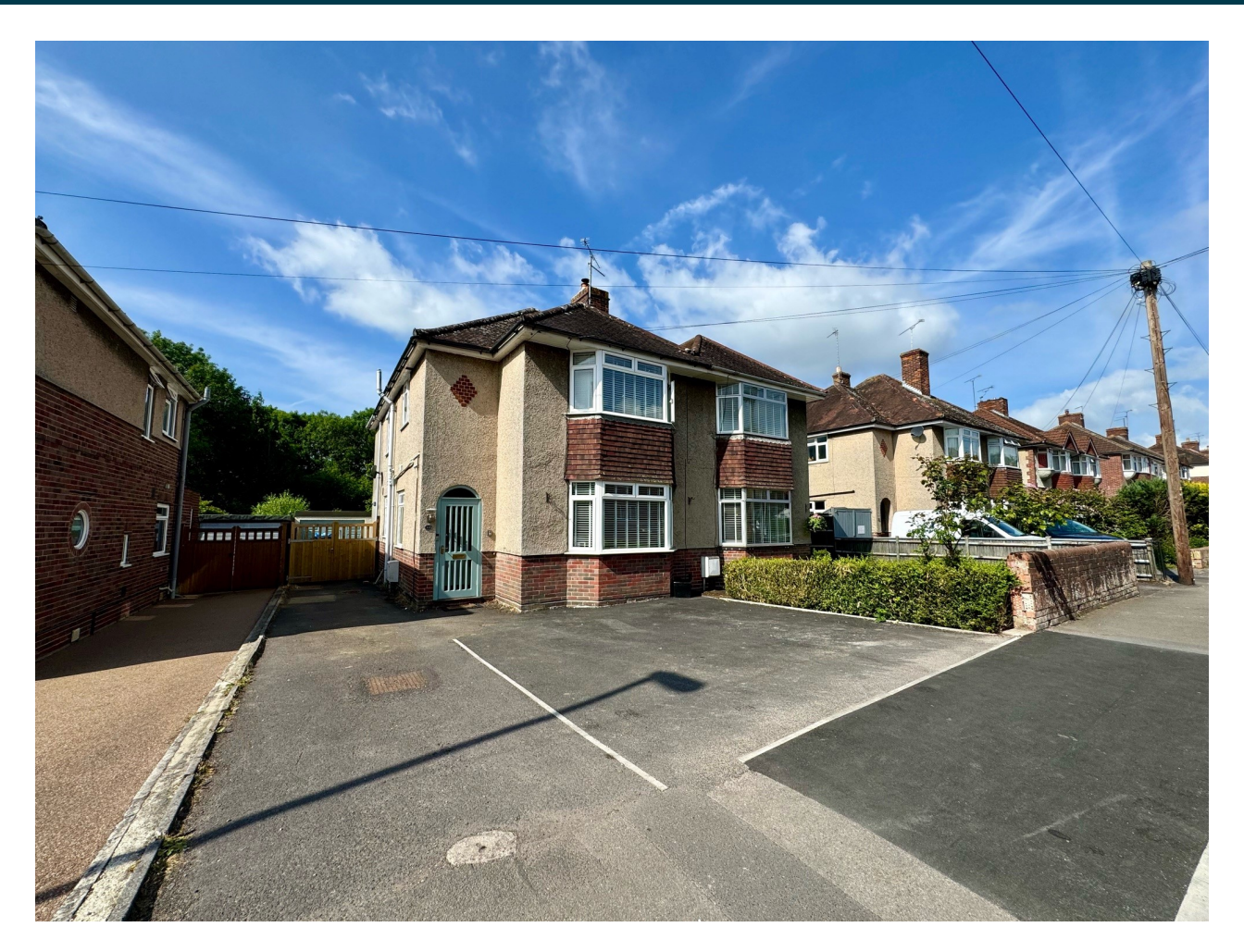
63, Preston Grove, Yeovil, Somerset BA20 2BJ Guide Price £365,000

√ 01935 577 032 | 01460 298 530 | ✓ info@towerswills.co.uk